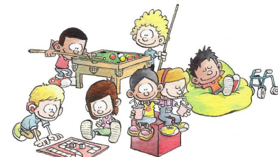
Illustration : clex leonard

You should be able to meet friends, unless there is a good reason why not