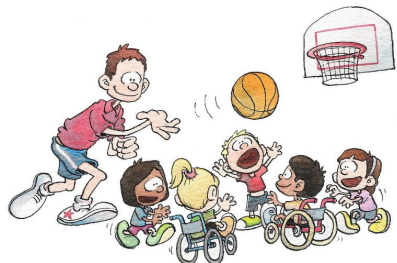
Illustration : clex leonard

Children with disabilities should be helped to take part in things