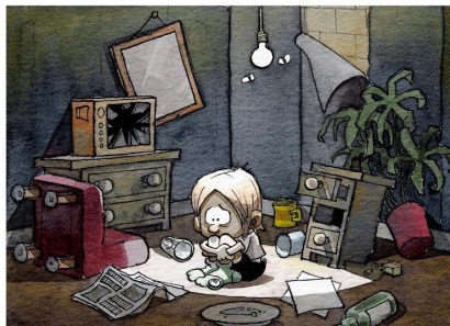
Illustration : clex leonard

The people who look after you should not hurt you