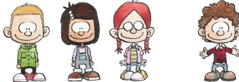
Illustration : clex leonard

You should have a say in decisions that affect you