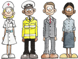
Illustration : clex leonard

WE SHOULD ALWAYS DO WHAT'S BEST FOR YOU!