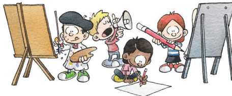
Illustration : clex leonard

You should be able to say what you think in lots of different ways